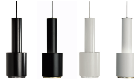
A110 PENDANT LIGHT "HAND GRENADE" *, Alvar Aalto 1952 Steel shade, steel ring, black shade with black ring or brass plated ring, white shade with white ring or brass plated ring