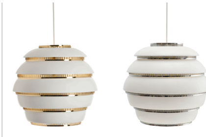
A331 PENDANT LIGHT "BEEHIVE" *, Alvar Aalto 1953 White painted aluminium shade, brass or chrome plated steel rings