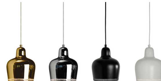
A330S PENDANT LIGHT "GOLDEN BELL" *, Alvar Aalto 1937 Brass shade, chromed steel shade, black steel shade, white steel shade, all inside white