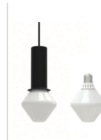
TW003 PENDANT LIGHT* , WIR-105 LED* LIGHT SOURCE , Tapio Wirkkala 1960 Black painted steel