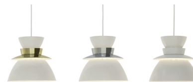
U336 PENDANT LIGHT* , Jørn Utzon 1957 White painted steel shade, middle reflectors in brass plated steel, chrome plated steel or white painted steel