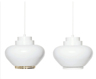
A333 PENDANT LIGHT "TURNIP" *, Alvar Aalto 1950's White painted shade, brass plated or white ring